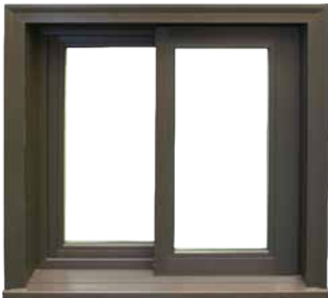
Fusionwood Series sliding window in Bronze exterior

Fusionwood Series windows and patio doors, are built from new solid core frame technology and feature real wood interior veneers, that give the look of a true wood window with all the benefits of a vinyl frame. Fusionwood frame material is a revolutionary combination of PVC and acrylic-based polymers. These unique resin combination will not absorb moisture, so it will not crack or rot. Fusionwood material is exceptionally stable in cold, hot or humid climates. With outstanding thermal performance Fusionwood products are a great choice for energy efficiency.