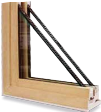
Fusionwood corner cut including frame and sash, pine interior finish

*Values may vary per window style and grid options.